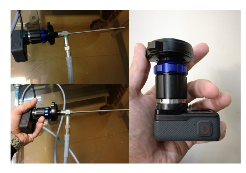
Figure 2. Demonstration of Modified GoPro Camera With a Coupler, Scope, and Light Attachment

which were limited to cranial disorders, to achieve an endoscopic surgical view for thecal sac lesions and other spinal disorders [11]. In 1998, Perneczky and Fries succeeded in integrating a rigid endoscope with a viewing angle of 0 to 110 degrees and a diameter of 2 to 5 mm with the microsurgery setting [12]. This innovation extended the visual perception of minimally invasive surgery (MIS) techniques until, three years later, Tamaki et al. proposed a solution for so-called "dark areas" to microscope's view by a combination of an angled rigid endoscope with a viewing angle of 75 degrees, the diameter of 2.7 mm, and depth of focus of 2 to 50 mm to create a picture in picture feature, with simultaneous display of endoscopic and microscopic images [13]. Due to limited capacity to maneuver, adjacent vital neuro-